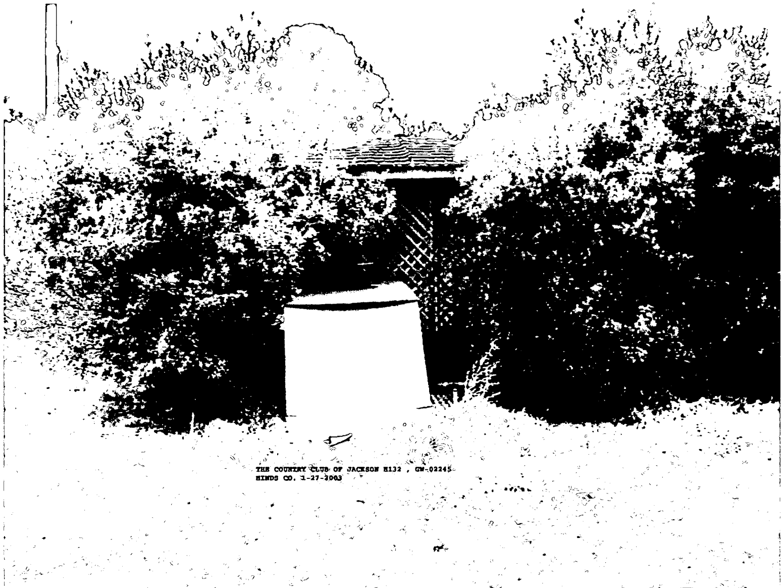
THE COUNTRY CLUB OF JACKSON H132 , GW-02245 HINDS CO. 1-27-2003