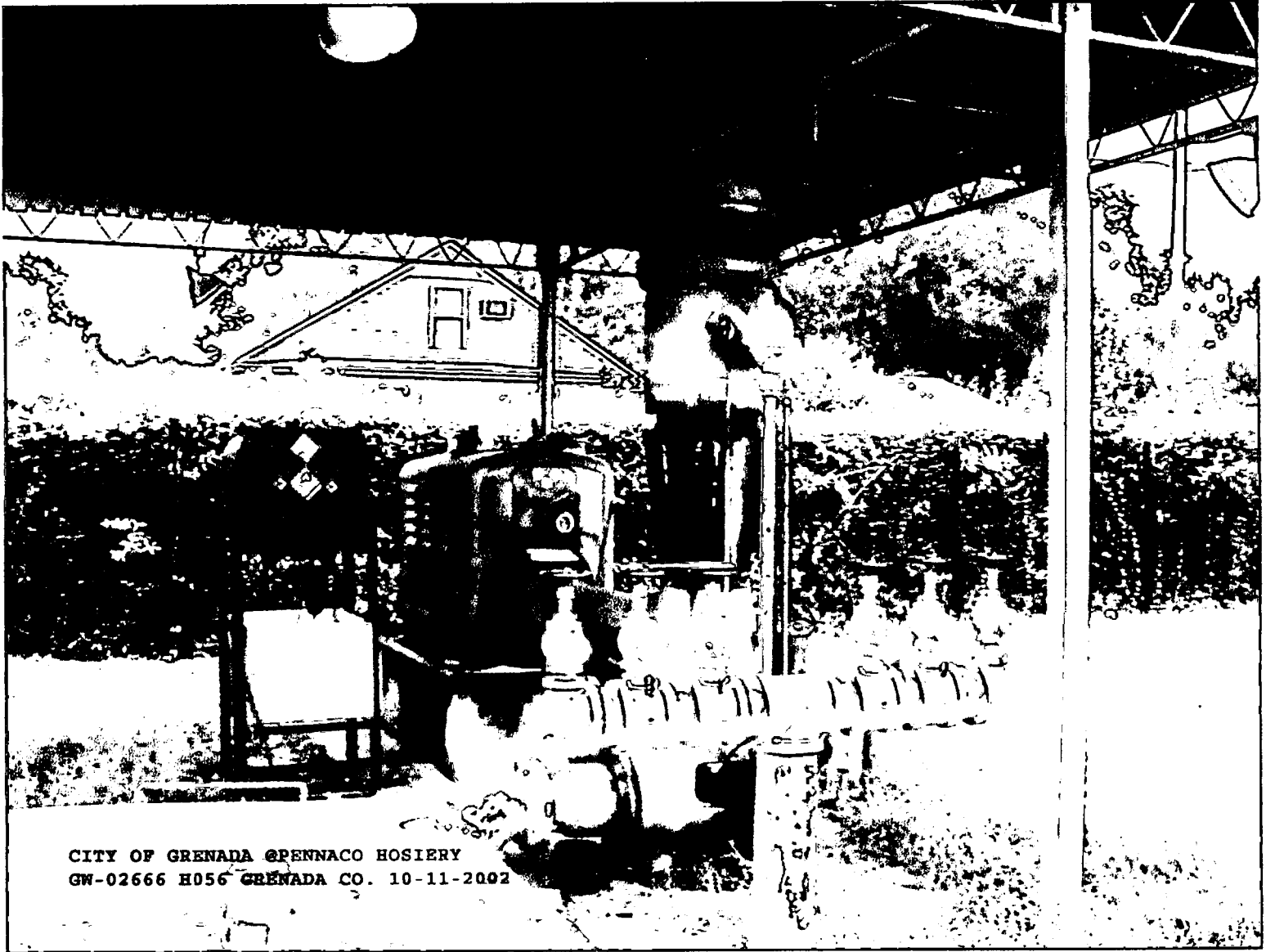
CITY OF GRENADA @PENNACO HOSIERY GW-02666 H056 GRENADA CO. 10-11-2002