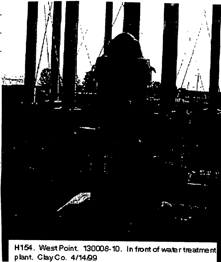
H154. West Point. 130008-10. In front of water treatment plant. Clay Co. 4/14/99