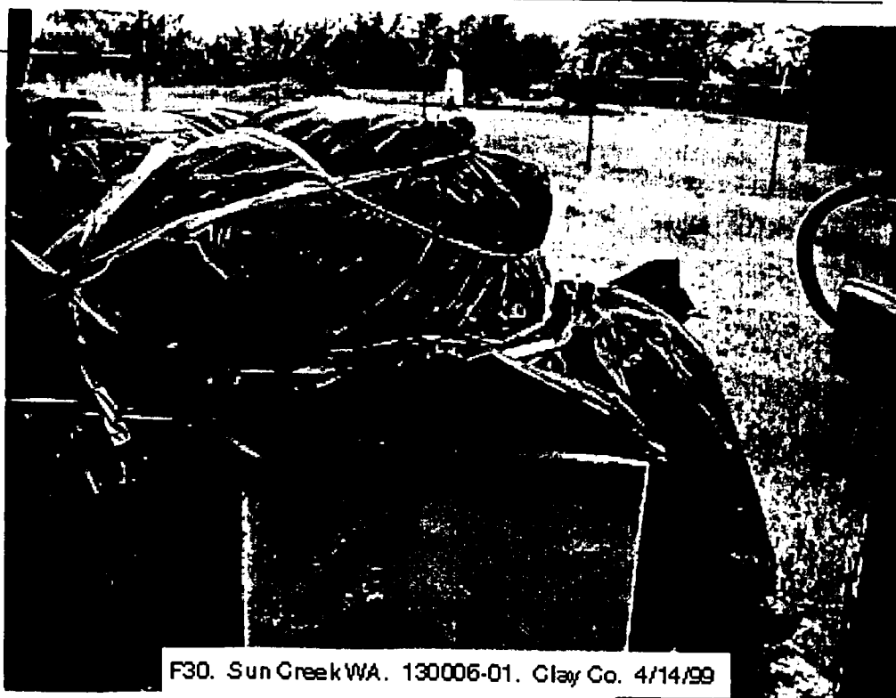
F30. Sun Creek WA. 130006-01. Clay Co. 4/14/99