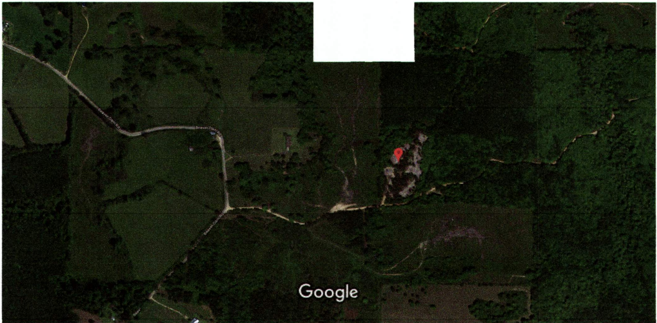
Imagery ©2018 Google, Map data ©2018 Google 200 ft