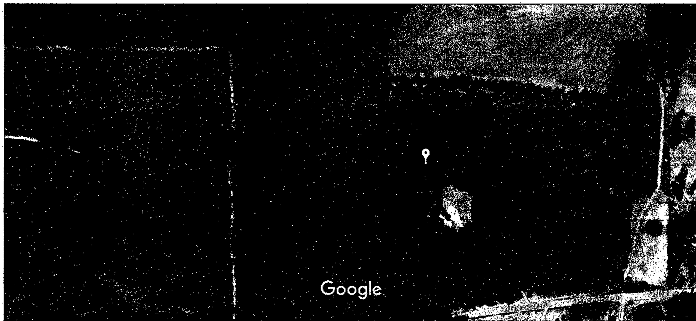
Imagery ©2017 Google, Map data ©2017 Google 100 ft