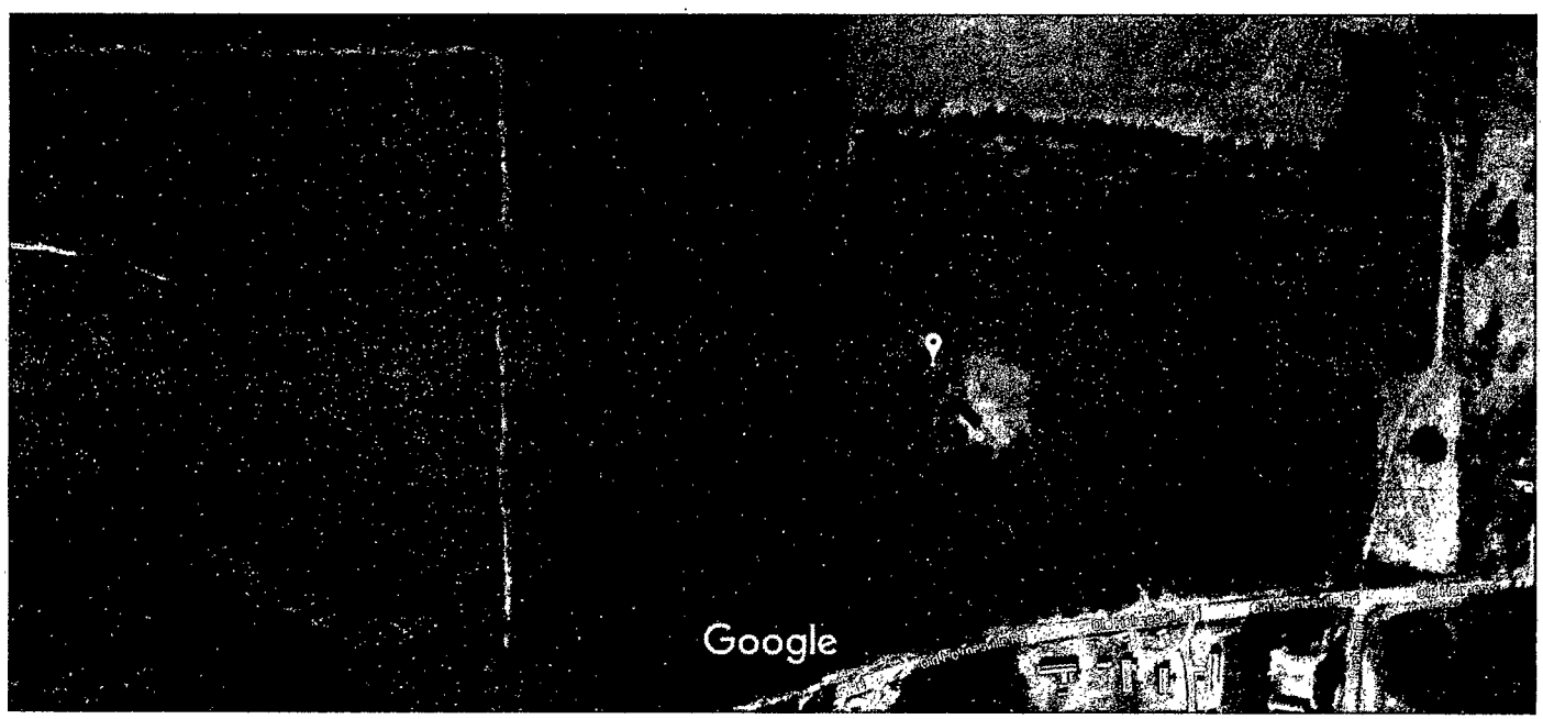
100 ft