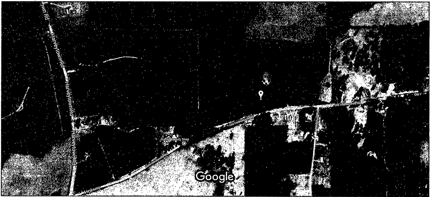
200 ft