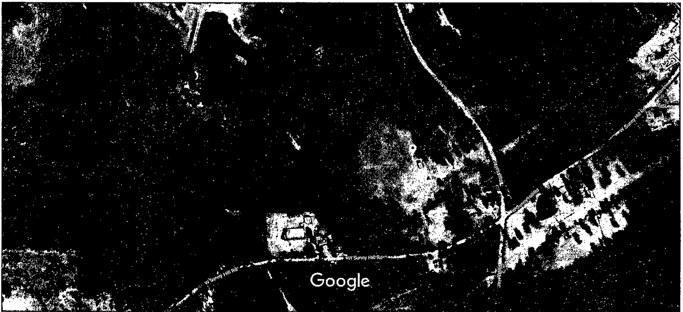
200 ft