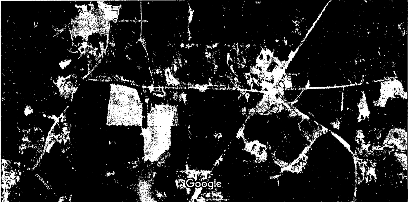
200 ft