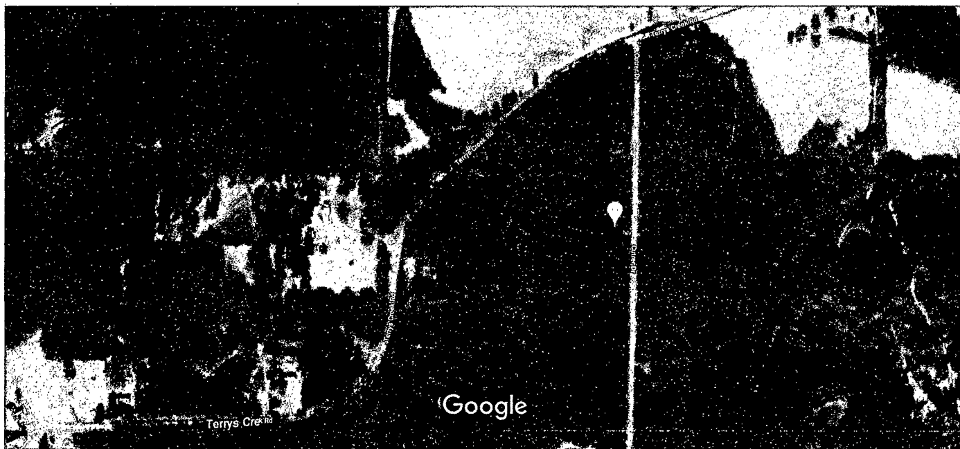
200 ft