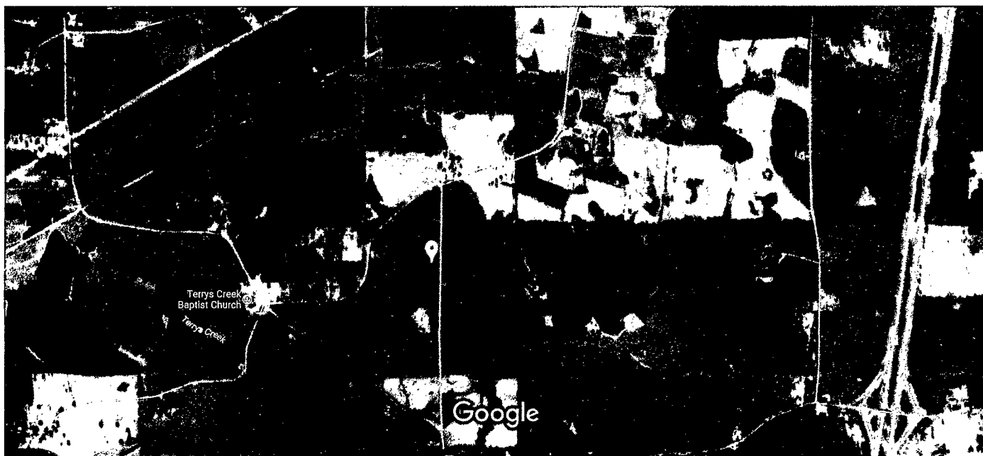
Imagery ©2017 Google, Map data ©2017 Google United States 1000 ft