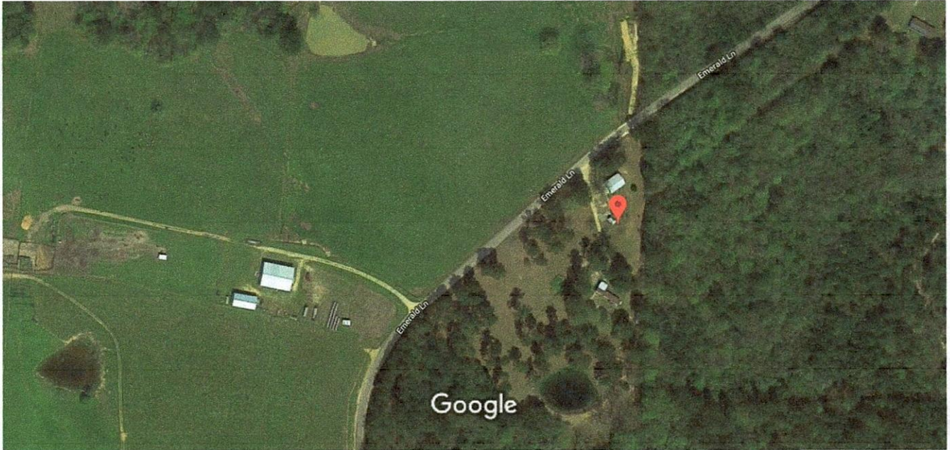
200 ft