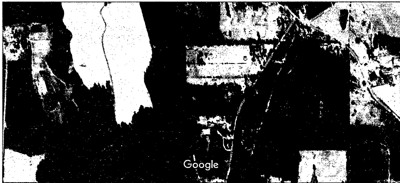
200 ft