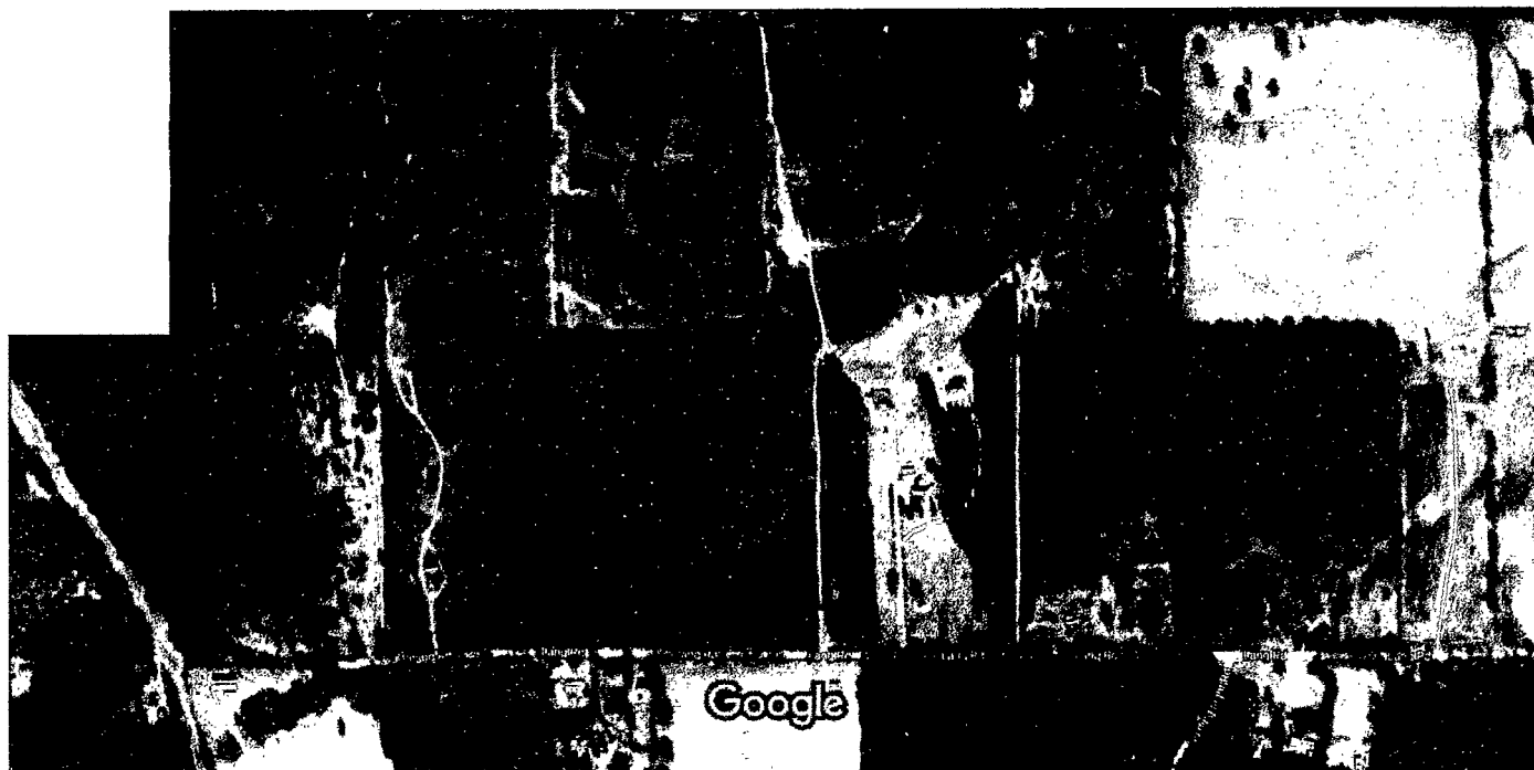
200 ft