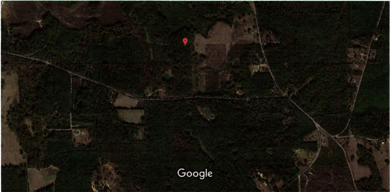
Imagery ©2018 Data SIO, NOAA, U.S. Navy, NGA, GEBCO, Landsat / Copernicus, Google, Map data ©2018 Google 500 ft