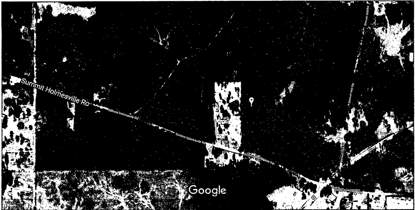
Imagery ©2017 Google, Map data ©2017 Google 200 ft