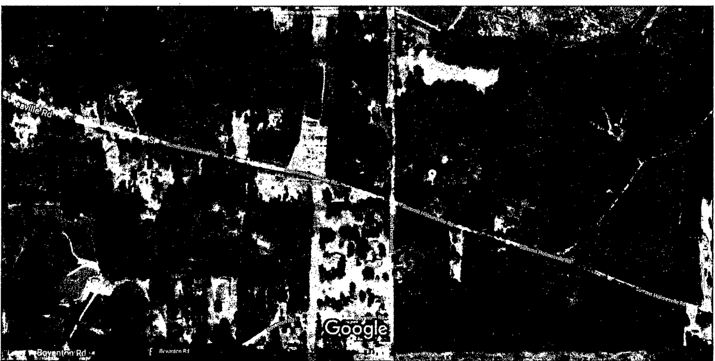
United States 200 ft