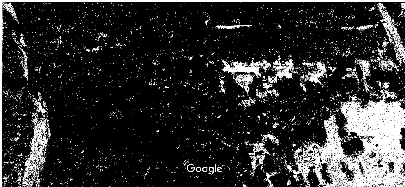
100 ft