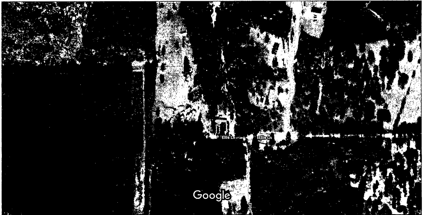
Imagery ©2018 Google, Map data ©2018 Google 200 ft