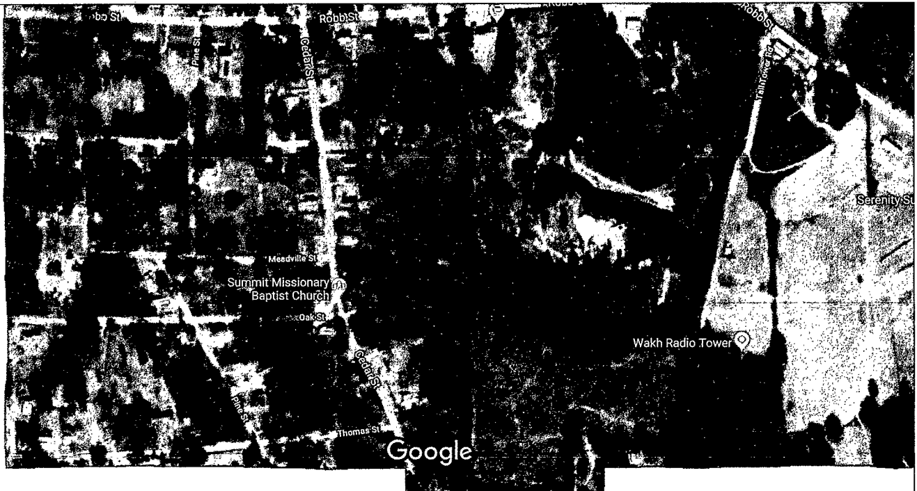
Imagery ©2018 Google, Map data ©2018 Google 200 ft