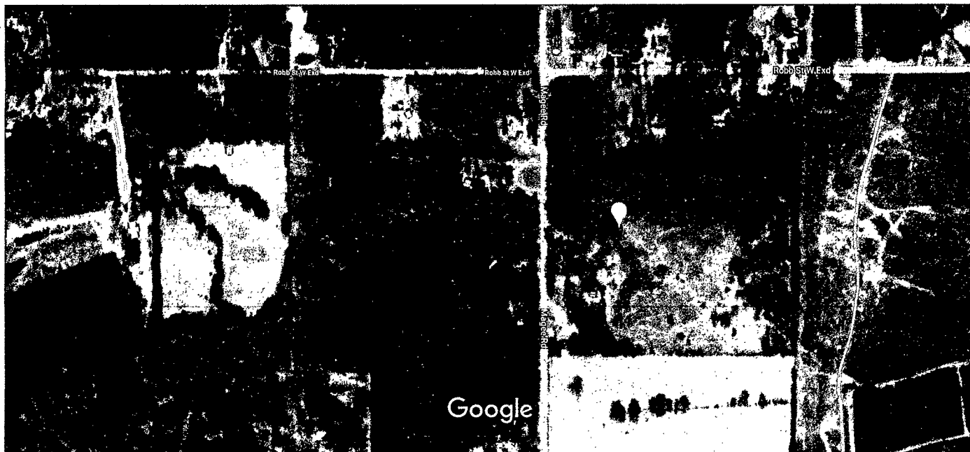
Imagery ©2018 Google, Map data ©2018 Google 200 ft