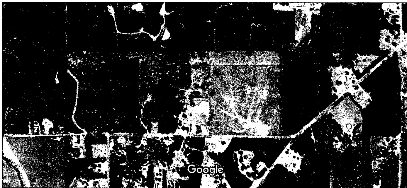
Imagery ©2017 Google, Map data ©2017 Google 200 ft