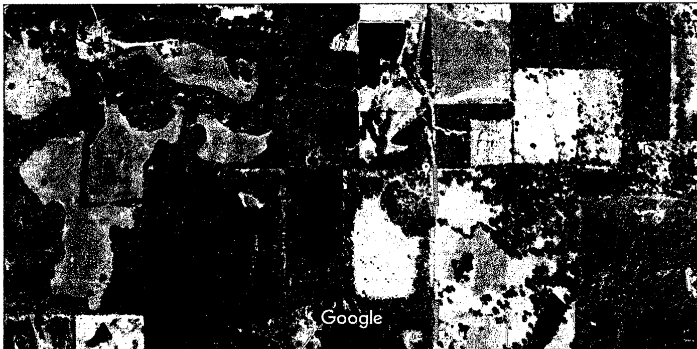
200 ft