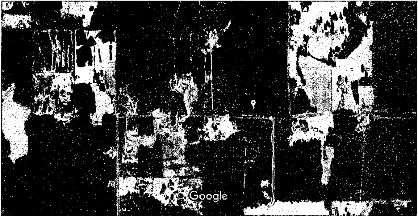
200 ft