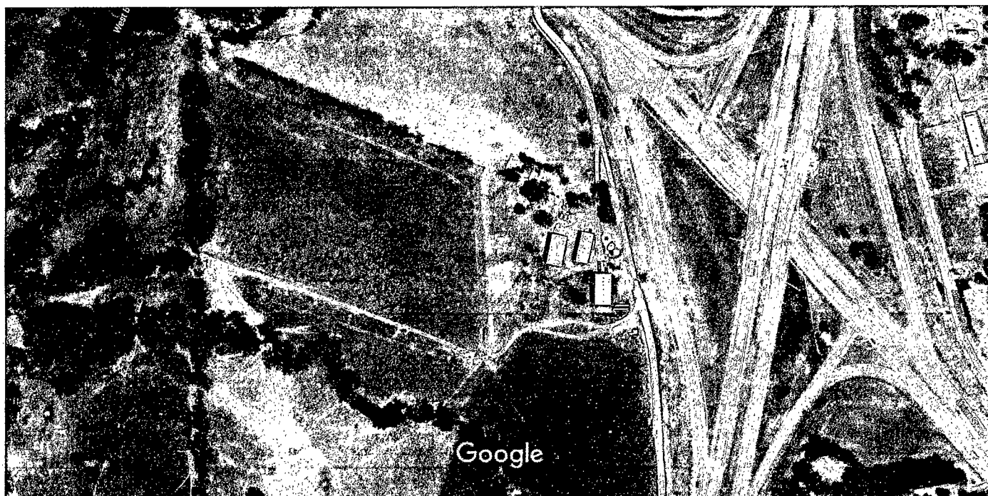
Imagery ©2016 Google, Map data ©2016 Google 100 ft