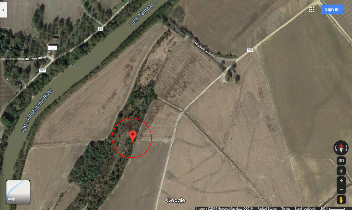
Figure 1. Location of monitoring well OW-08 near Shellmound, MS.