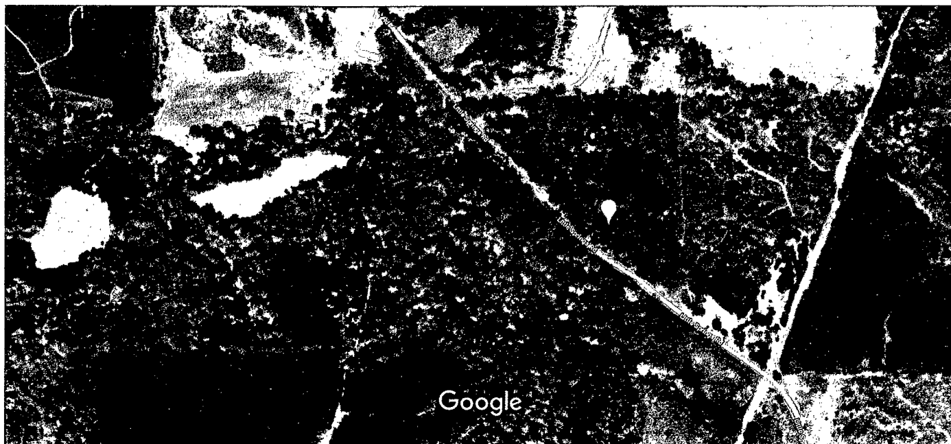
200 ft