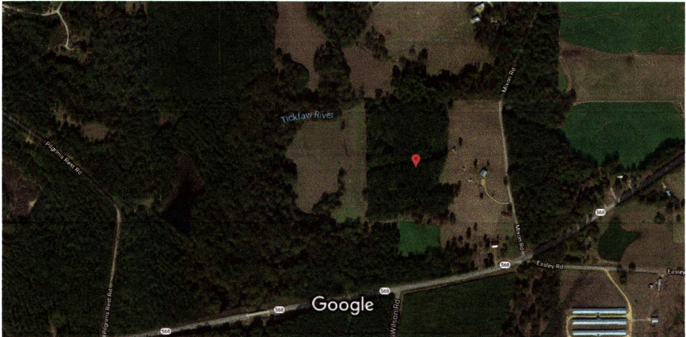
Imagery ©2018 Google, Map data ©2018 Google 200 ft