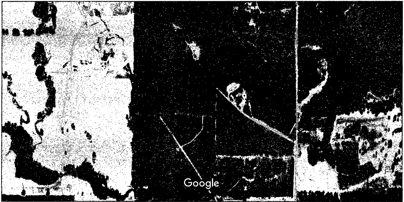
Imagery ©2017 Google, Map data ©2017 Google United States 200 ft