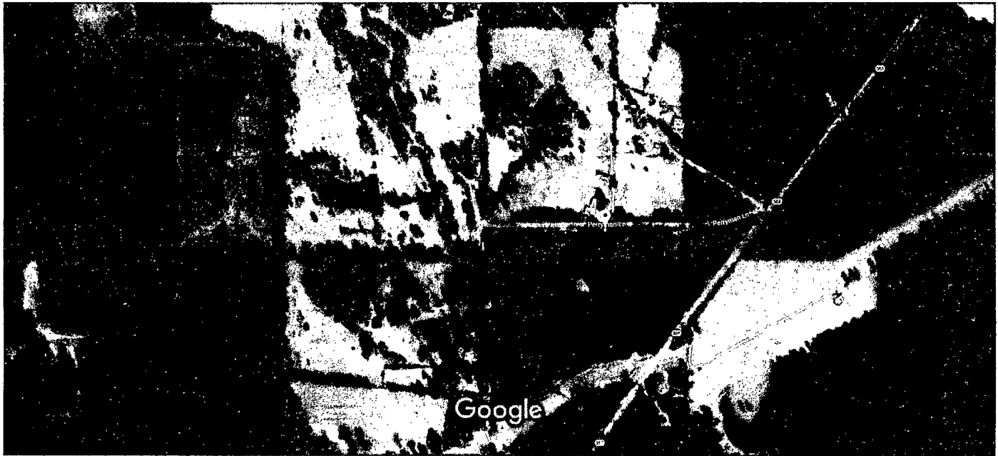
200 ft