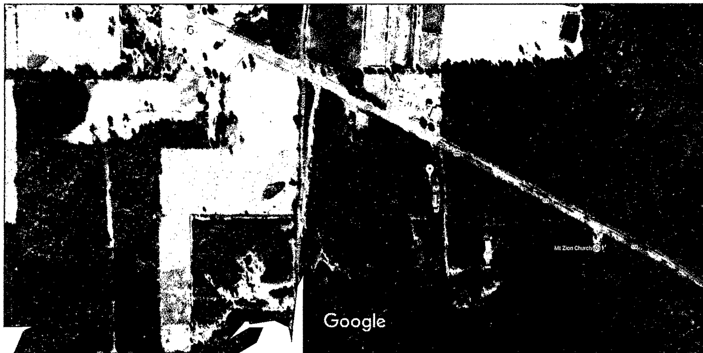
Imagery ©2017 Google, Map data ©2017 Google United States 200 ft