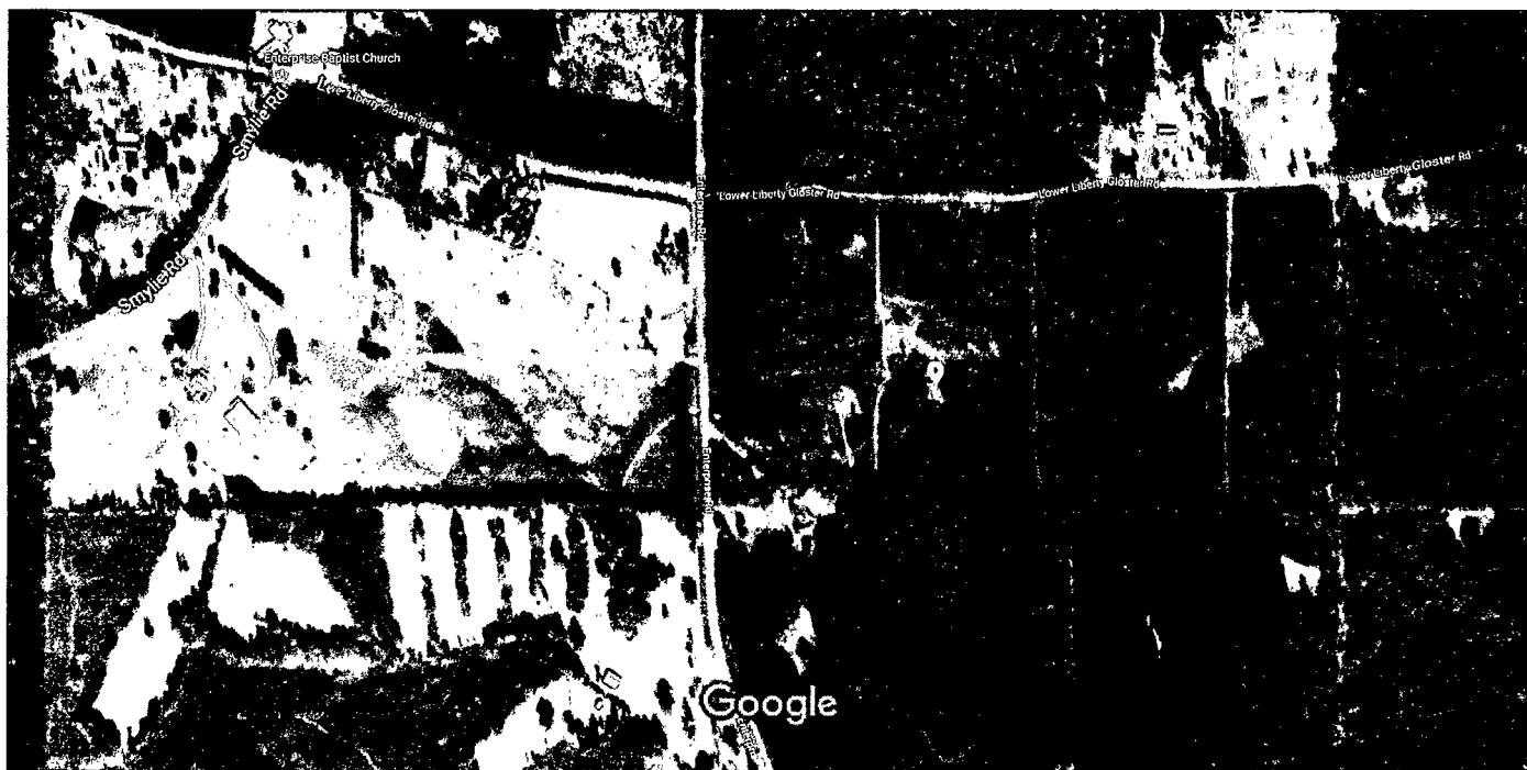
United States 200 ft