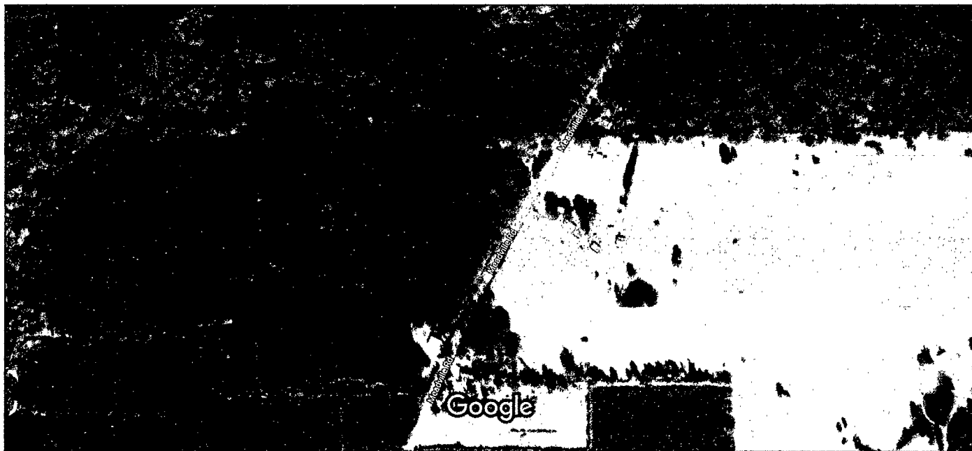
Imagery ©2017 Google, Map data ©2017 Google United States 200 ft