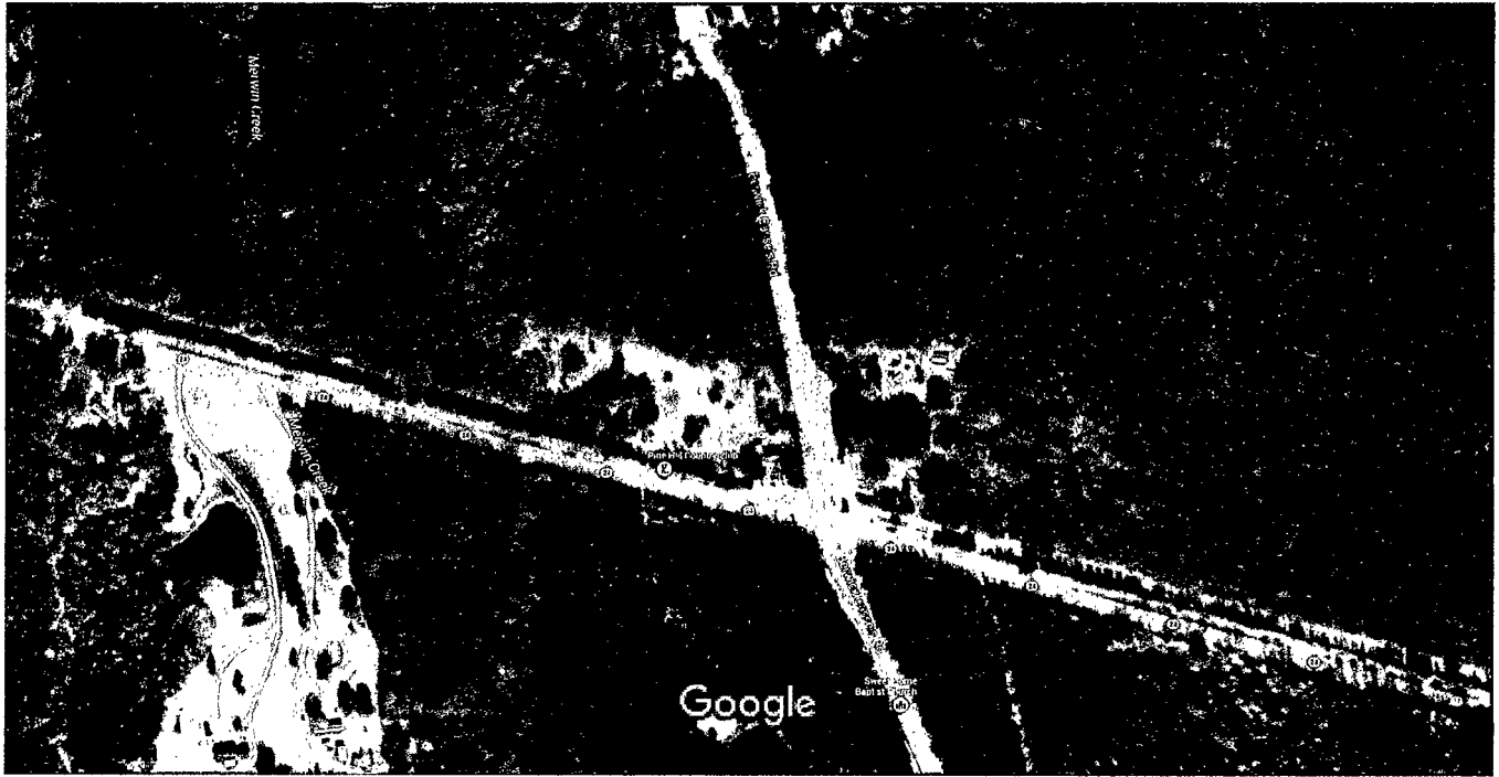
200 ft