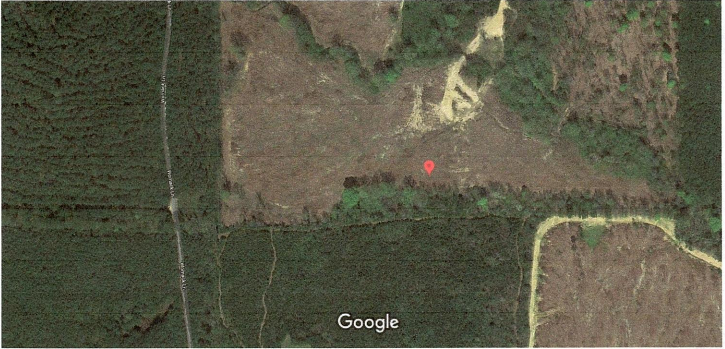
Imagery ©2021 Maxar Technologies, USDA Farm Service Agency, Map data ©2021 100 ft