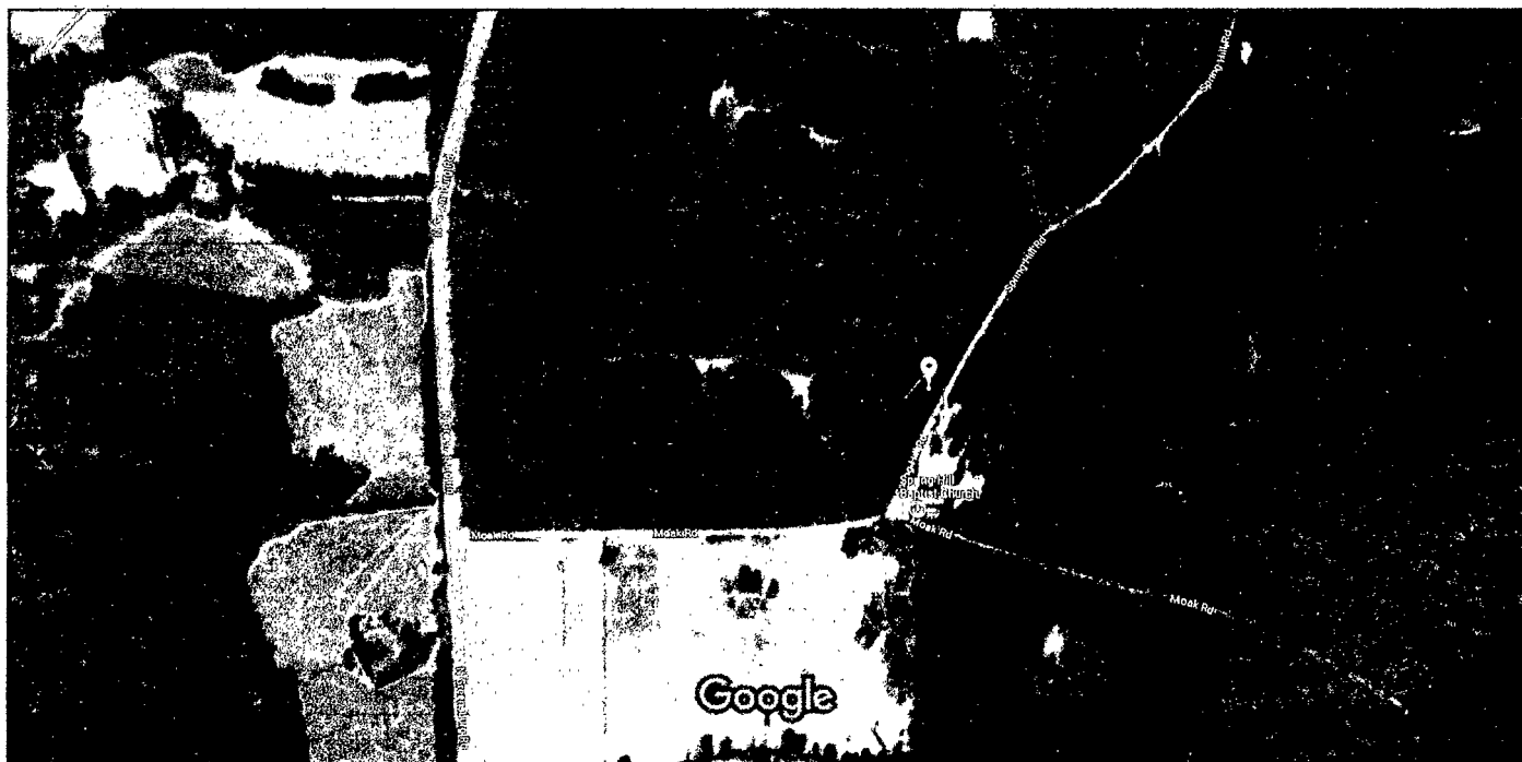
United States 200 ft